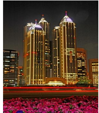
Capital Plaza Towers, Abu Dhabi Corniche

Sofitel, the Pride of ACCOR Hospitality will add a French fingerprint on the Corniche of Abu Dhabi.